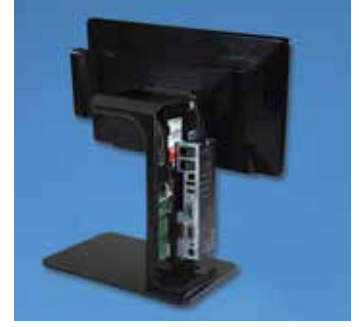
Easy Access to Ports – Easily Replace SSD and RAM Without Tools