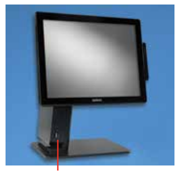
Two Additional USB Ports – Choice of Touch Screen Sizes and Processors