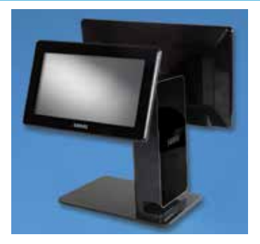
Choose From 9.7", 10.1" or 15" Optional Integrated Rear LCD Customer Displays