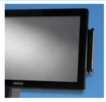
Triple-Track Card Reader Standard