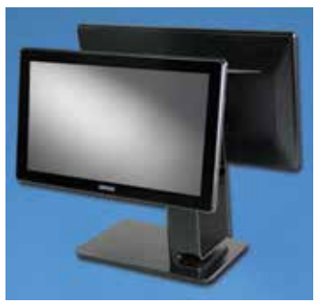
Choose From 10.1" or 15.6" Optional Integrated Rear LCD Customer Displays