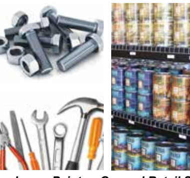
Hardware, Paint or General Retail Stores