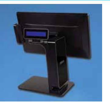
Optional Integrated 2-Line LCD Customer Display