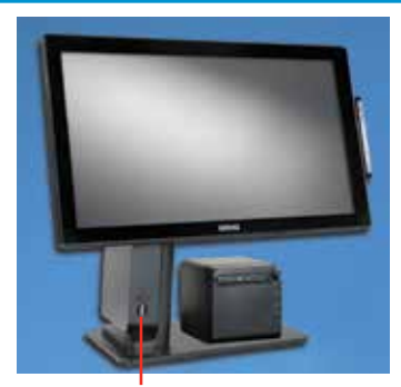
Two Additional USB Ports