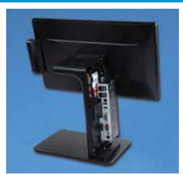
Easy Access to Ports – Easily Replace SSD and RAM Without Tools