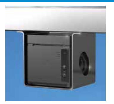
Optional Under Counter Bracket (Shown) and Wall Mount Bracket Available