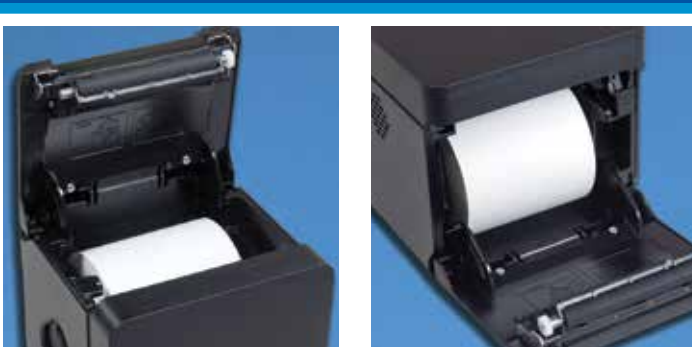
Spill-Proof Cabinet With Drop and Print Paper Loading