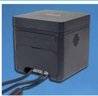
Standard Cable Cover For Cable Management