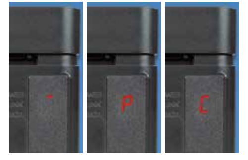
LED Printer Status Notification Such As Paper-End, Cover Open